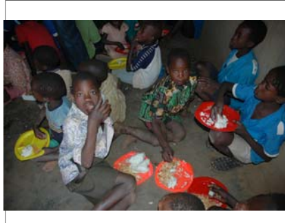
Orphans eating their lunch

We fed between 150—200 orphans at each of the schools with nsima and a cabbage relish. At one school we also provided sticks of sugar