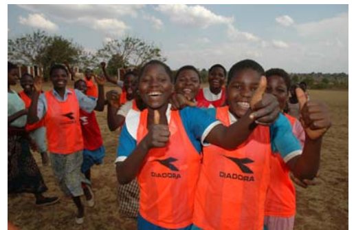
Playing with tennis rackets and the excitement of playing Netball with coloured bibs!