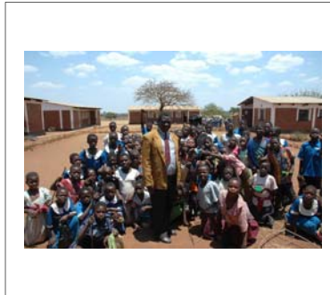
Chibwata Primary School

The Landirani Trust will be producing a School Information Pack on 'typical village life in Malawi' next year aimed at Key Stage 2. If a school is interested in acquiring one of these please inquire at: info@landirani.org It will have a DVD,