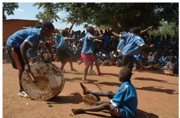
Traditional dancing and drumming

After the Orphan lunches the children showed us some of their talents. These ranged from Traditional dances with Traditional drumming to reading out poetry and showing things that they had made using local natural resources.