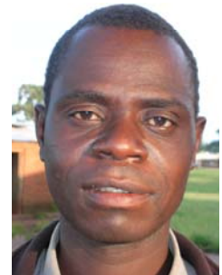
Haile Manuel Chikuyakuti Centre