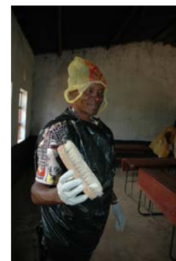
Dama wearing the latest fashion!