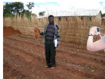
Reforestation of Acacia trees / banana and papaya trees growing / vegetable nursery and vegetable seedlings planted out.