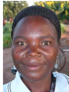
Catherine Salima Masiye Centre