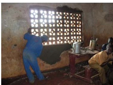
Renovating the windows that had fallen out of two classrooms.