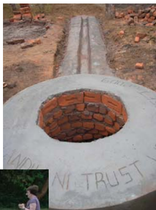
Building up wells in the villages and playing with the children.